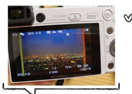
It's my life ♥