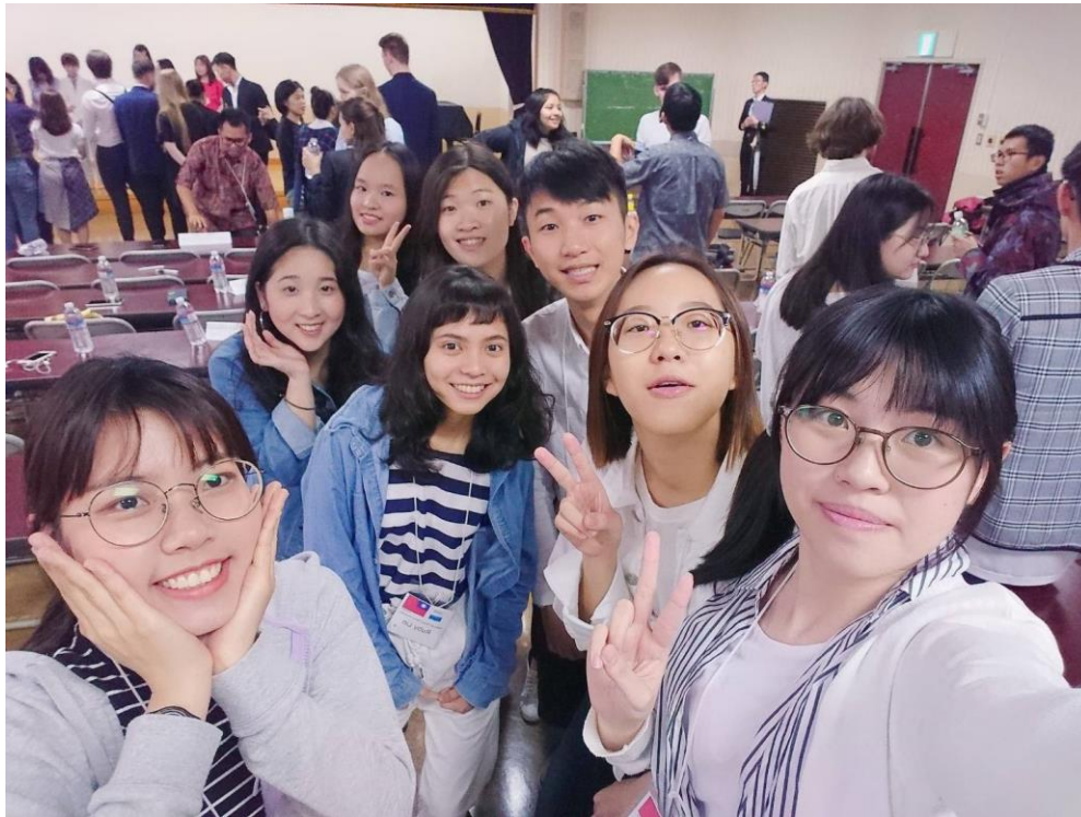
Visit to the Mayor of Ichikawa City

In the weekend, we went to Shibuya and Akihabara , at there we saw the famous cross road, it was a good memory to me. Thanks CUC for giving us this nice chance to join this project !