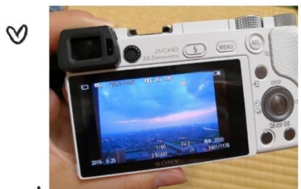
♥ Ichikawa Sta. 的日落 ♥

Happy time is always short. Best wishes to CUC Summer Program and best wishes to CUC. Hope to see you again!